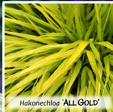
Hakonechloa 'ALL GOLD'